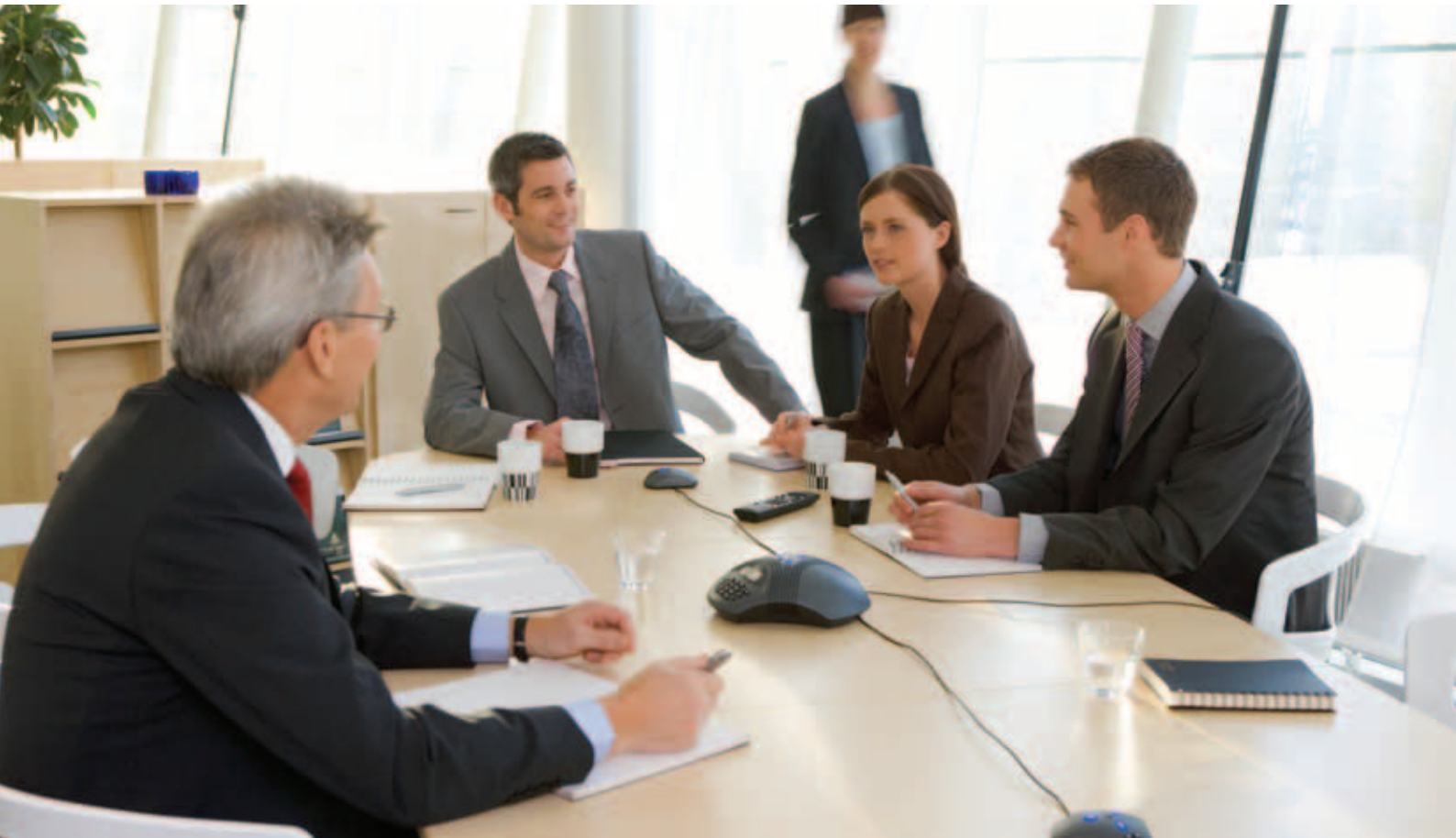
Conference phones for every situation